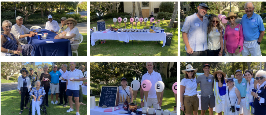
Photos from Ice Cream Social at Montecito Shores

Looking ahead, mark your calendars for November 8th! The Montecito Shores Progressive Dinner promises to be another memorable evening. More details will follow, but as always, it will be a great way to gather with neighbors and share in the spirit of community.